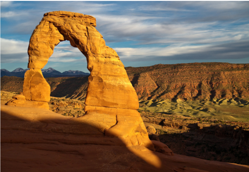
“Last Light at Arches” by Tim Starr