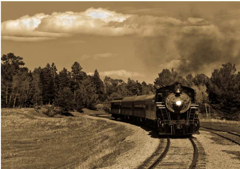
“Rio Grande Tour” by Yolanda Venzor