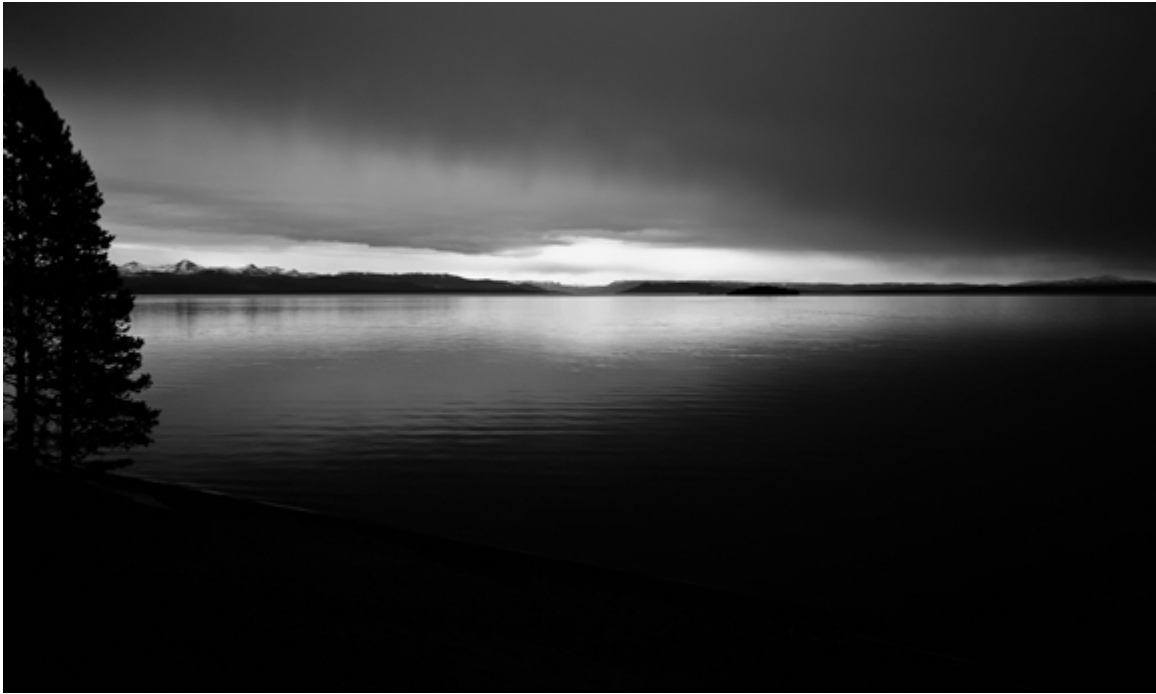
“Yellowstone Lake” by Debi Boucher