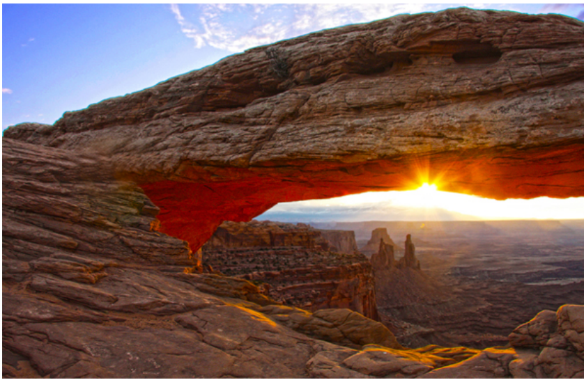
"Breaking Dawn at Mesa Arch"